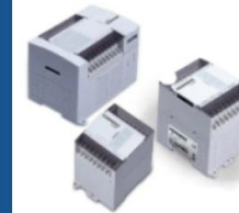
Emotron- EmoLog & EmoSmart for PLC's