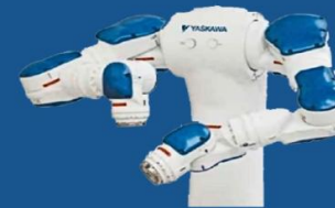
Industrial Robotics "MOTOMAN"