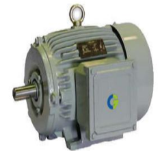
High/ Low Voltage AC & DC Motors