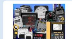
Test & Measuring