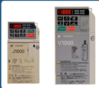
Variable Frequency AC Drive (0.5 KW - 5000 KW)