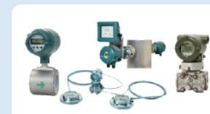
Field & Analytical