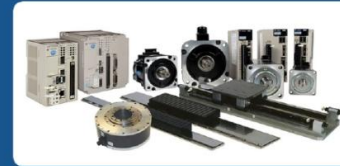
Motion Control Products Servo Drives and Motors

Founded in 1915 in Japan, Yaskawa is world's largest manufacturer of Motion Control products for Industrial Automation and OEM's.